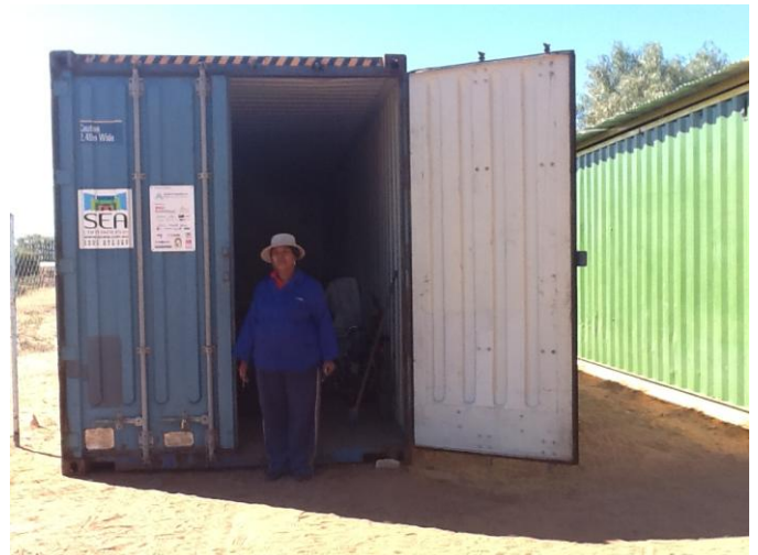
Second container in place at Gobabis BEC

The container that these bikes were packed in has become a storage facility for the BEC in Gobabis. This is one of the first BECs to benefit from receiving a second container – using one as the shop and the other for storage/workshop.